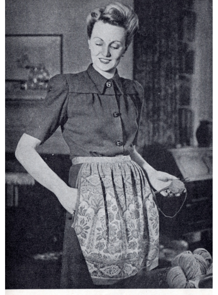
FOR MOTHER. A gaily patterned knitting bag cleverly disguised as an apron. The material is folded to form a large bag and the double thickness set into a waistband. Work is placed in pockets thus formed.